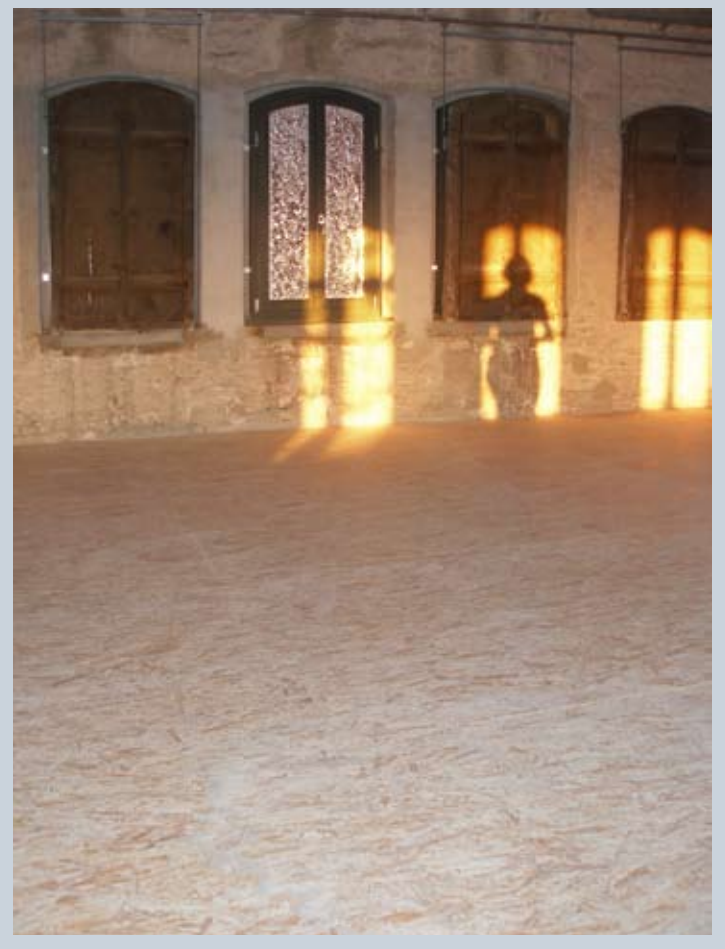
"Moon night at the Observatory", space-installation / detail

July 2008 "Oder-Odra VII": German-Polish workshop and exhibition at ,Kunstbauwerk Vierraden'