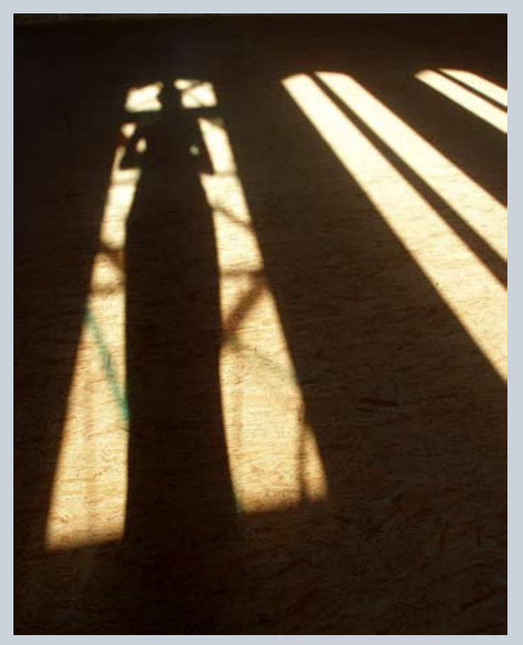
"Shadows and Structures" / selection

"Moon night at the Observatory" was installed on the top floor of the building that resembles a sacral space, caused by high windows.