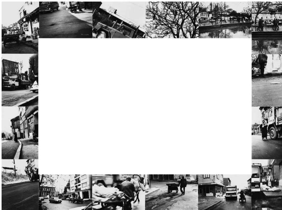
„In the Streets of Estambul“

Photographic diaries: Since my film studies at the San Francisco Art Institute in 1978-79, I have used the medium of photography to create Memory Frames, which represent ‚silent‘ films about people and places from my life. As in a diary, experiences and everyday images are photographically recorded and combined into a story.