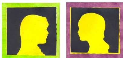
„Menschen wie Du und ich“ („People like you and me“)

„ein-seh-bar“, culture salon of Frauenkunstforum Ostwestfalen-Lippe at Bielefeld Library (participation with small multiples)