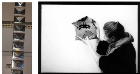
„Magic Correspondence“, a row of reflecting envelopes

„Arkadien lebt“ (Arcadia is alive), GEDOK-exhibition at Zeche Zollverein, Essen (participation with an installation) > gedok-nrr.de/pdf/Arkadien%20lebt%20_Rede.pdf <