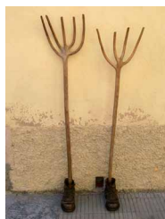
„Guards of the House“, hall stand made of old work shoes and traditional hay forks

„Furnish Me“, international design-workshop in Llorenç del Penedès/Spain (participation with objects produced from discarded furniture and utilities) > www.casamarles.org < see projects