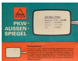
„Object of Desire“ (70 Trabant car rear-view mirrors in their original box, model luxury right) / 3 concave mirrors)

„Furnish Me“, international design-workshop in Llorenç del Penedès/Spain (participation with objects produced from discarded furniture and utilities) > www.casamarles.org < see projects