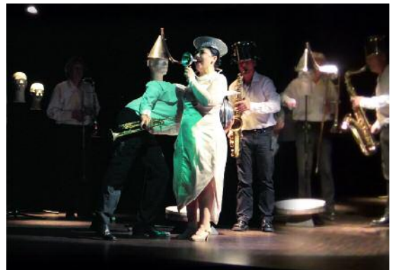
Image: performance of „Pea(ce Soup“, by Pauline Oliveros, the second dish from my 'Kitchen Symphony', at the Labirynt Festival in Slubice/Poland, screenshot from the video