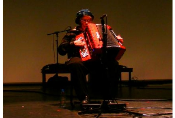
Image: „Pauline Oliveros playing her electronic accordeon“, screenshot from the video

Presentation of my video sketch „Pauline Oliveros in Berlin“ from 2016; https://vimeo.com/user5695583