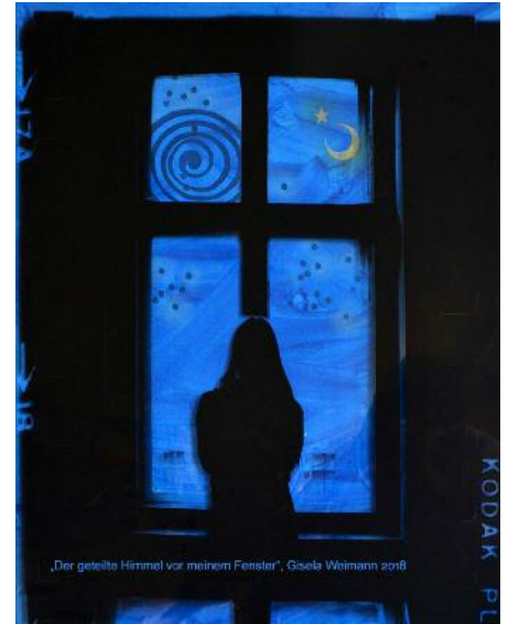
Image: „The divided sky in front of my window“, negative film on watercolour and collage, 60 x 50 cm, 2018